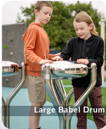
Large Babel Drum