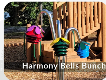
Harmony Bells Bunch