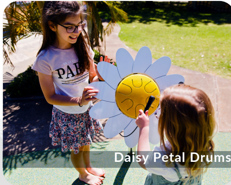
Daisy Petal Drums