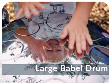
Large Babel Drum