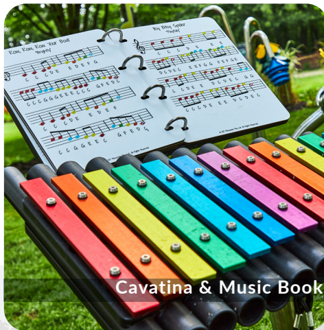
Cavatina & Music Book