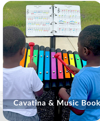
Cavatina & Music Book