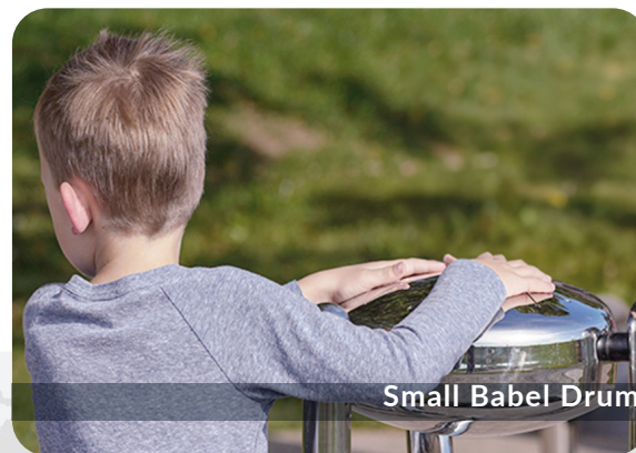
Small Babel Drum