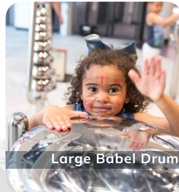
Large Babel Drum