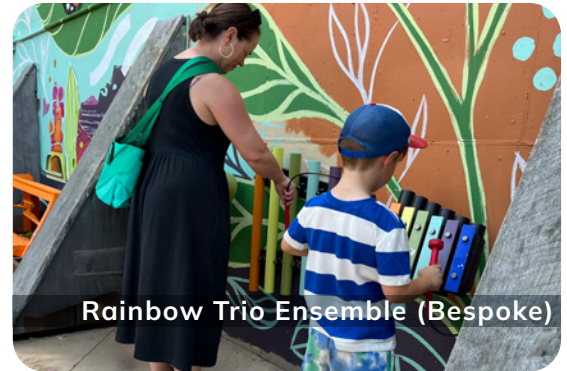
Rainbow Trio Ensemble (Bespoke)

Volunteer Coordinator at Madison Children's Museum