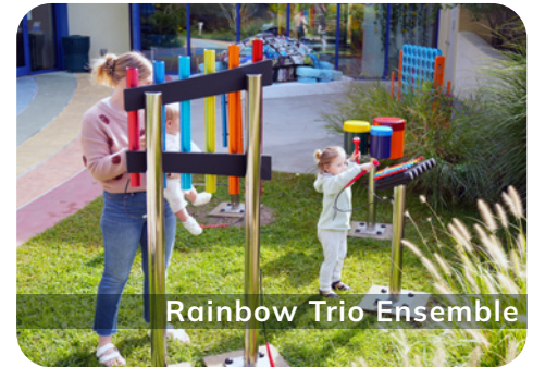
Rainbow Trio Ensemble