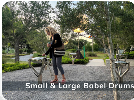
Small & Large Babel Drums