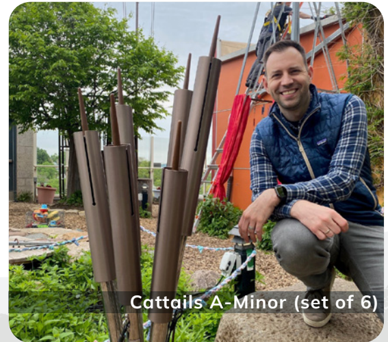
Cattails A-Minor (set of 6)