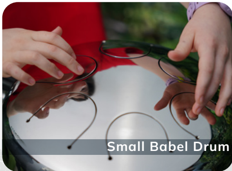
Small Babel Drum

The perfect music-making spot is the Music Hummock, a glen with small trees among 11 round Babel Drums. The stainless-steel tongue drums vary in height and size, creating a playful hide-and-seek space where children weave between drums and trees. With pentatonic tuning, many can play at once, producing a harmonious sound. The Hummock both draws visitors in with music and surprises them with beautiful, kid-sized instruments hidden in the landscape.