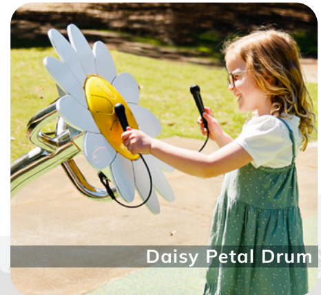
Daisy Petal Drum