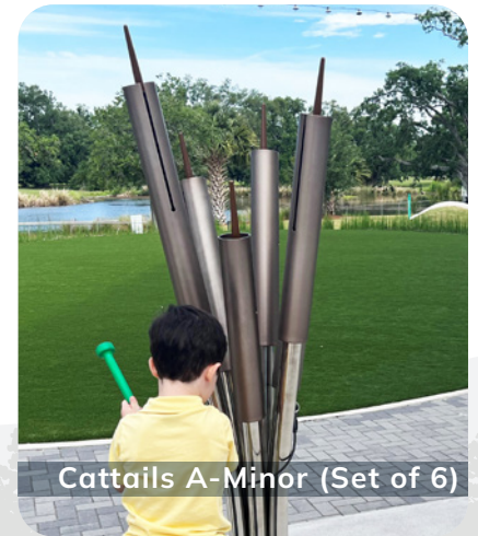
Cattails A-Minor (Set of 6)