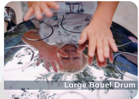
Large Babel Drum