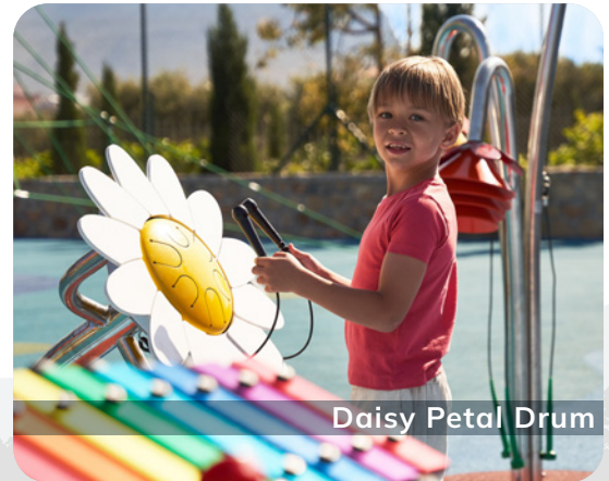
Daisy Petal Drum