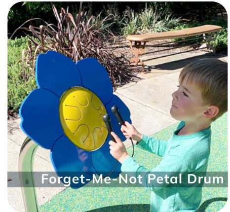
Forget-Me-Not Petal Drum

Executive Director at Play Sharity Children's Museum