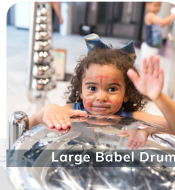
Large Babel Drum